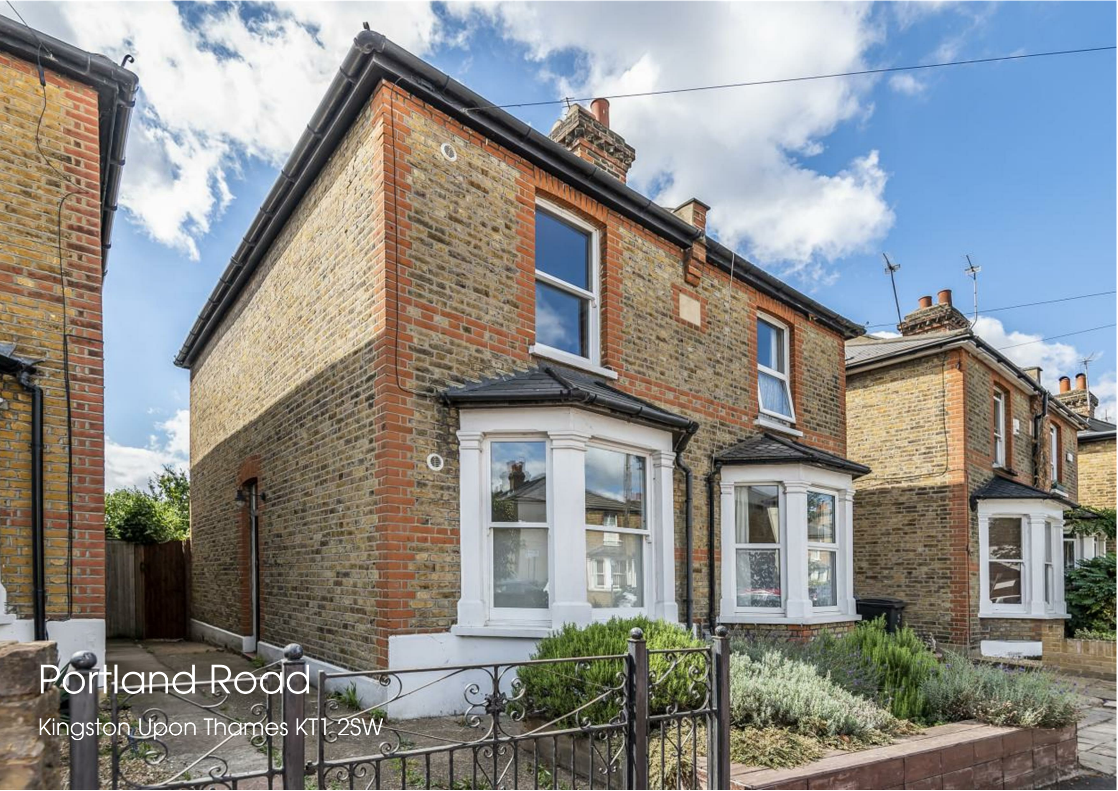
Portland Road Kingston Upon Thames KT1 2SW